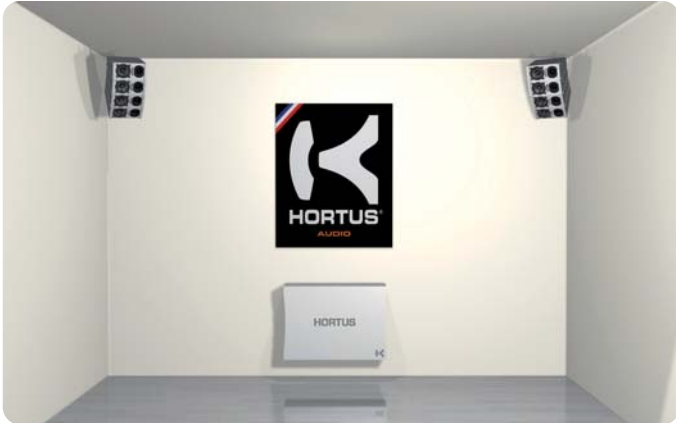
MIB-08S 3-way amplified + built-in DSP