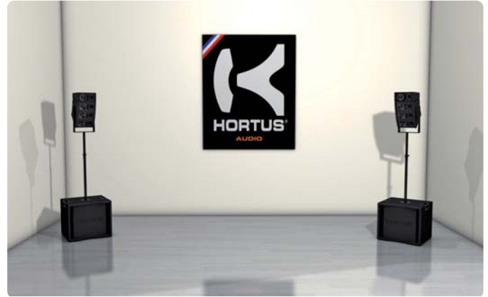
CBA-10M/S : Mono or stereo amplified + built-in DSP CBA-12M/S : Mono or stereo amplified + built-in DSP