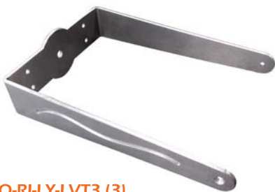
HO-RI-LY-LVT3 (3) - Aluminium U-bracket for wall mounting or on tube with adapter EU-01424