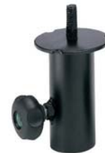
EU-01424 (4) - 35 mm Black Flange / M10 Screw.